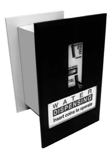
Model WM-RE with fascia